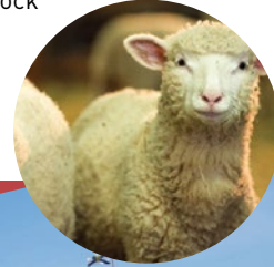
Hector Heritage Quay

Before arriving in Pugwash, consider a jaunt around the Malagash Peninsula, home to the first rock salt mine in Canada and Malagash Salt Miners' Museum. The peninsula offers the opportunity for quiet swims in the warm water of Tatamagouche