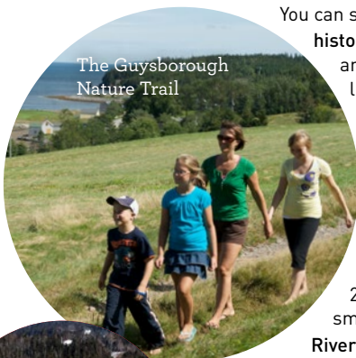
The Guysborough Nature Trail

With rolling hills and long stretches between towns, the route from Sherbrooke to Guysborough is ideal for long distance rides and a worthy challenge for the adventurous cyclist. Those who venture out to the Eastern Shore are rewarded with the undisturbed natural beauty of a road less travelled and a glimpse of the days when life was less complicated.