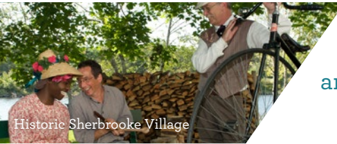
Historic Sherbrooke Village

Transport yourself from the daily grind to the serene Eastern Shore –a place where nature is at its rugged, wild, and wind-swept best.